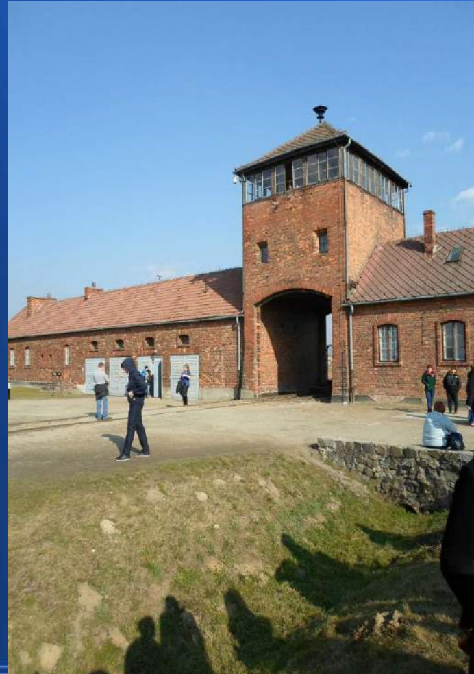
Brick Gate at Auschwitz-Birkenau